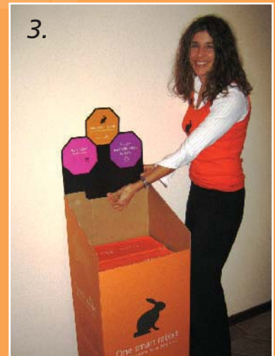
Attach case card to top of sleeve