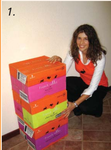
Stack cases 3 high by 2 deep

The Most Profitable Display in the Wine World!