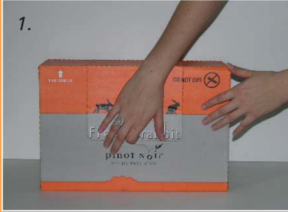
1. Punch perforated tab with index finger