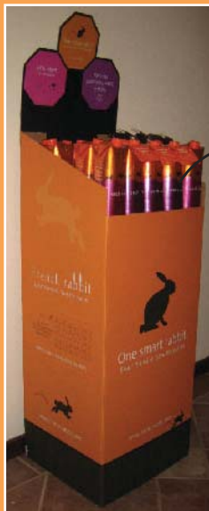
Final Display is 15" wide x 13" deep x 53" tall