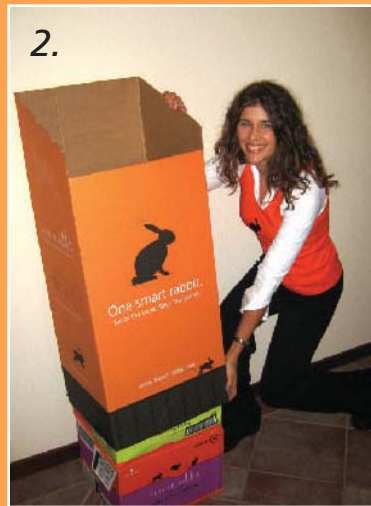
Open sleeve and slide over cases