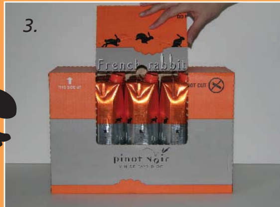
3. Remove flap or tuck into backside of case for display