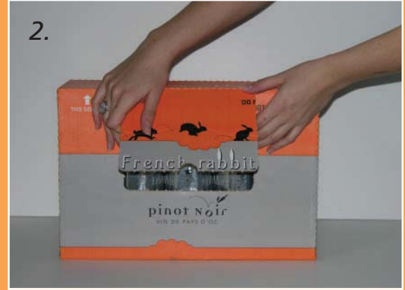
2. Pull up on perforated flap.